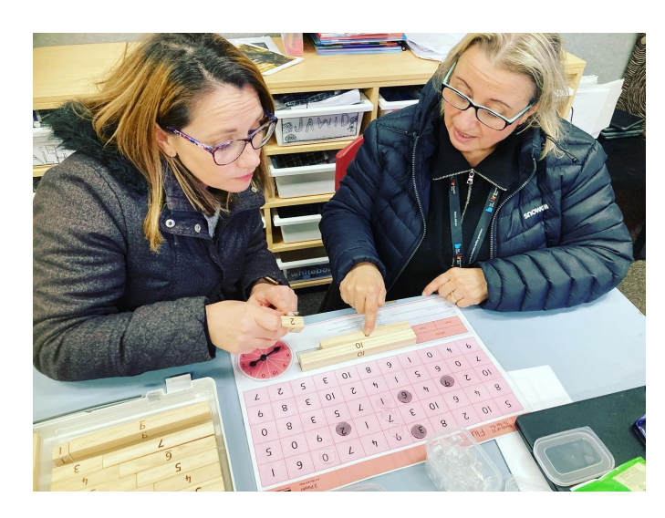
یادگیری مادام العمر در حال بررسی استراتژی های جدید در یادگیری و آموزش ریاضیات اولیه است