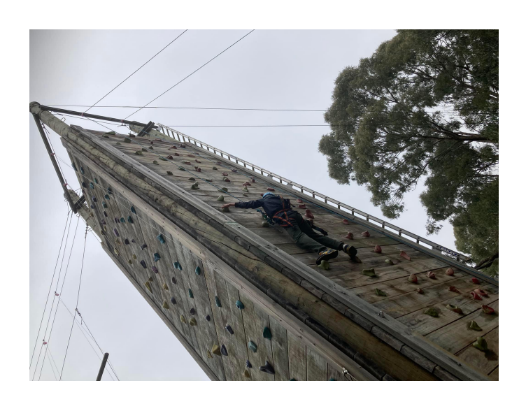
More photos on <u>Facebook</u> and <u>Instagram</u>...