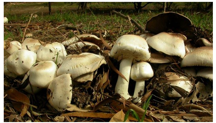
Yellow-staining Mushroom (Agaricus Xanthodermus).