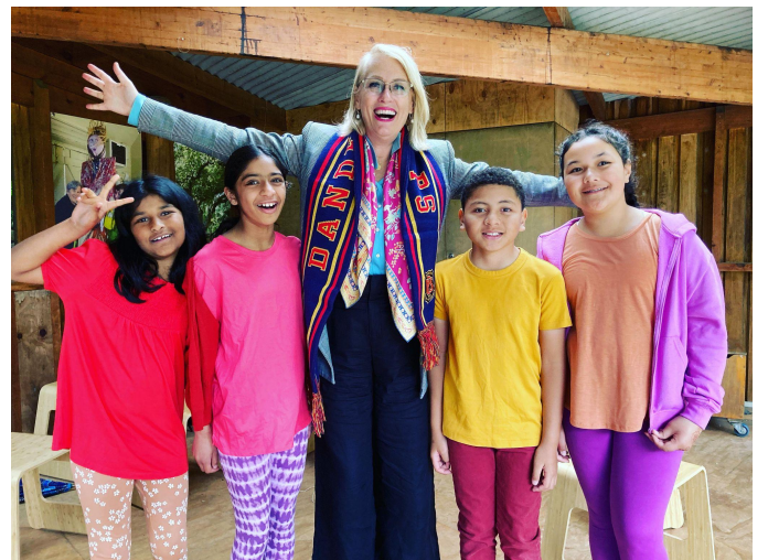
Scarves $15 (as modelled by Lord Mayor Sally Capp )