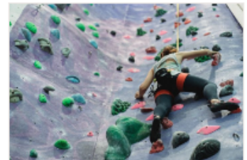
Rock Climbing Friday 30 June, 12:00pm