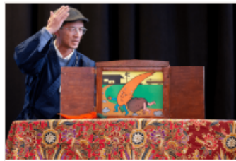
Kamishibai | Japanese Storytelling Workshop Tuesday 27 June, 10:00am