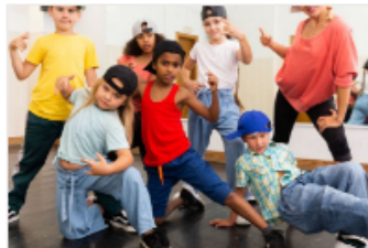
FULLY BOOKED - Hip Hop and Breakdancing - School Holiday... Thursday 29 June, 2:30pm