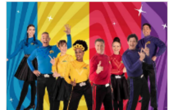
Hello! We're The Wiggles - LIVE in Concert Wednesday 28 June, 2:30pm