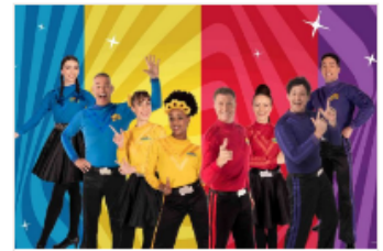
Hello! We're The Wiggles - LIVE in Concert Wednesday 28 June, 10:00am