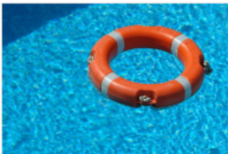
Water Safety Thursday 29 June, 12:00pm