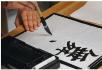
Chinese Calligraphy Monday 26 June, 2:30pm