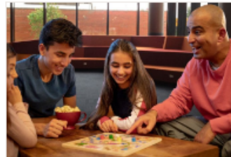
Family Fun - School Holiday Program Wednesday 28 June, 2:30pm