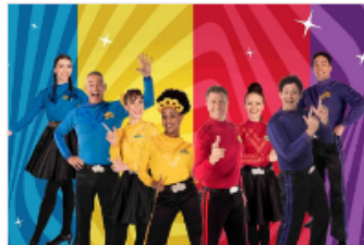
Hello! We're The Wiggles - LIVE in Concert Wednesday 28 June, 12:30pm