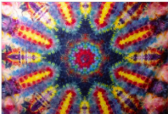
Tie Dye Creations Wednesday 28 June, 12:00pm