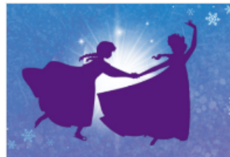
Disney's FROZEN Kids - Presented by Masquerade You... Friday 30 June, 11:00am