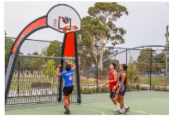
Get Up and Move! Tuesday 27 June, 11:00am